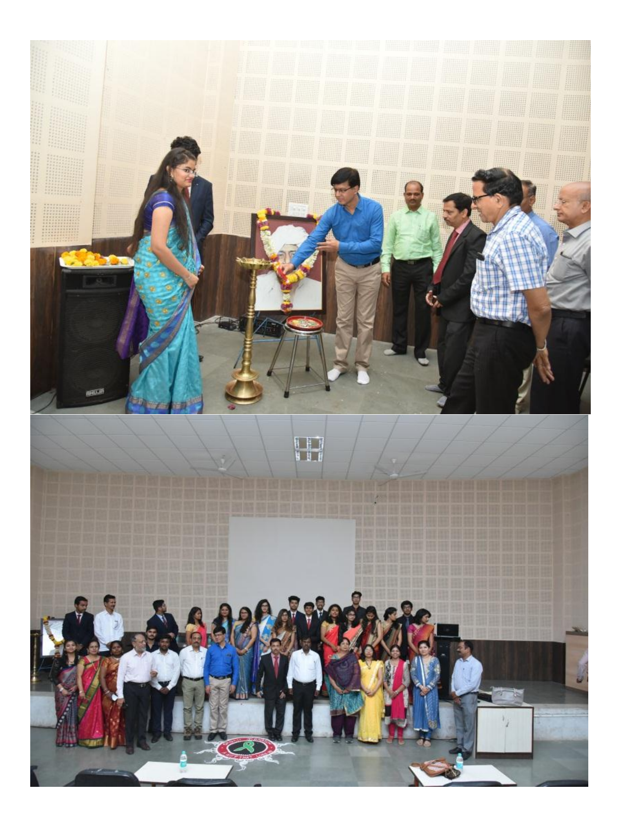
CME with ENT Department On Topic "Endoscopic approach and detailed anatomy of nose,PNS and Anterior skull base with cadaveric dissection" dated 7.2.2021